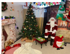
Santa's Grotto & Elfridges