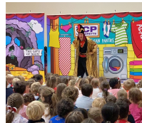
Panto - Aladdin